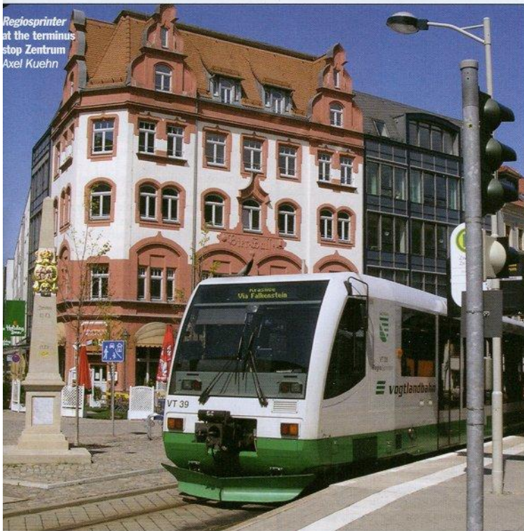
Regiosprinter at the terminus stop Zentrum Axel Kuehn

city centre. Zwickau did receive proper political support for this pilot project, which is expressed also in the fact that the public funding for the dual-gauge track section was 100%, while the usual funding rate in Saxony was 75%. The total costs for the first section of the tramway project (Neumarkt-Schedewitz) were estimated to be DEM 46 million, Zwickau received DEM 34.5 million in public funding; for the Vogtlandbahn integration a further DEM 35.6 million was received.