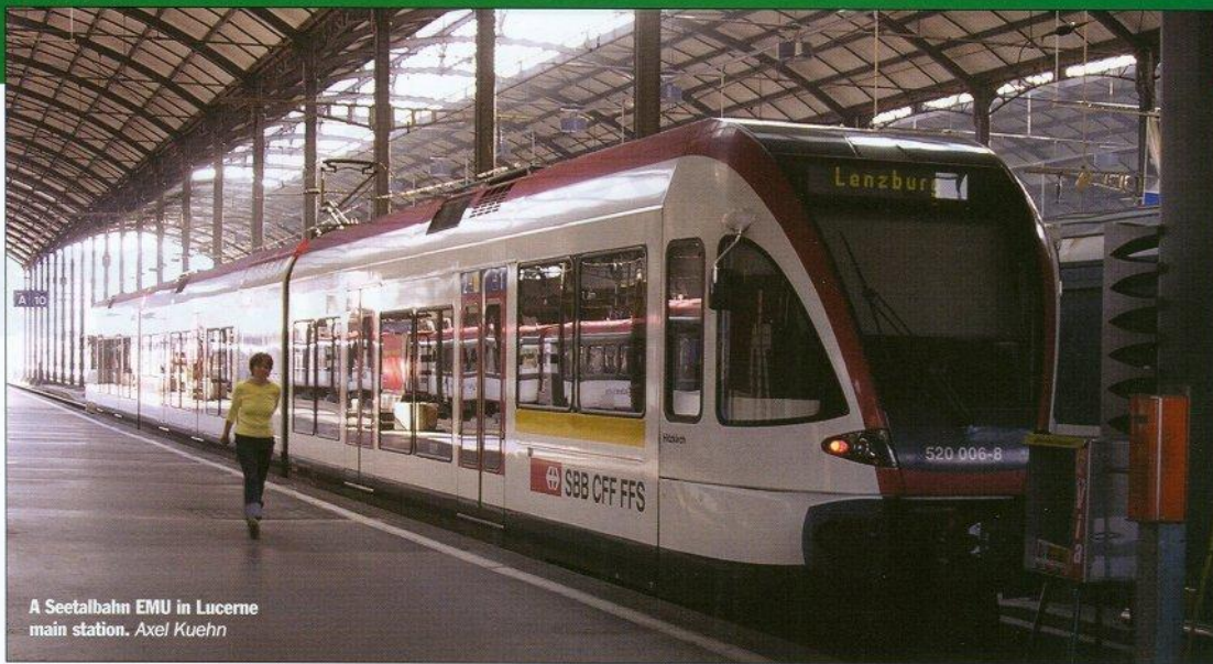
A Seetalbahn EMU in Lucerne main station.

introduced, while on other parts the maximum speed allowed was increased to 80km/h. Beyond this the Seetalbahn measure package also included more passing loops, additional stops, a new central control centre in Lenzburg, certainly removal of as many level crossings and improving the safety of others. The total investment was EUR 130 million.